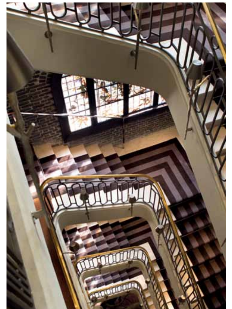
FRENCH FLAIR Clockwise from top left: The hotel’s entrance; a bedroom in the Presidential Suite; a glimpse at what the hotel can create for a wedding; the stairs leading up to the rooms; a wedding set-up at one of the salons; the La Cuisine restaurant